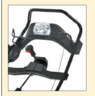
Ergo-handle with full bail switch allows for fatigueproof operation.

Provides clear information on the fuel level without the need for opening the gas cap.